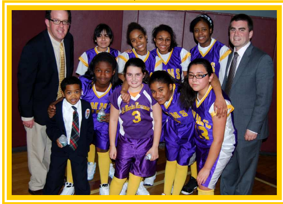
SMMS GIRL'S BASKETBALL TEAM 2009 – 2010