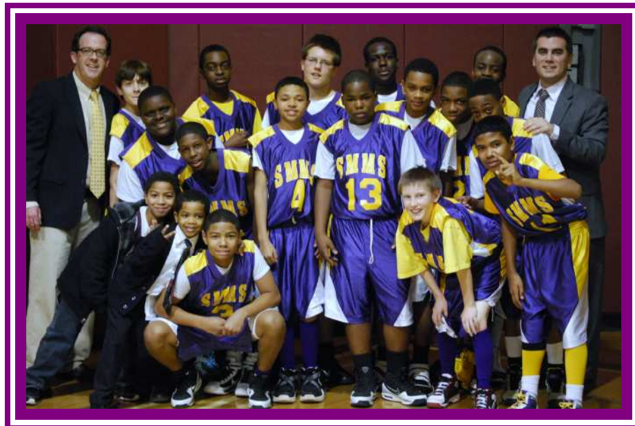
SMMS BOY'S BASKETBALL TEAM 2009 - 2010